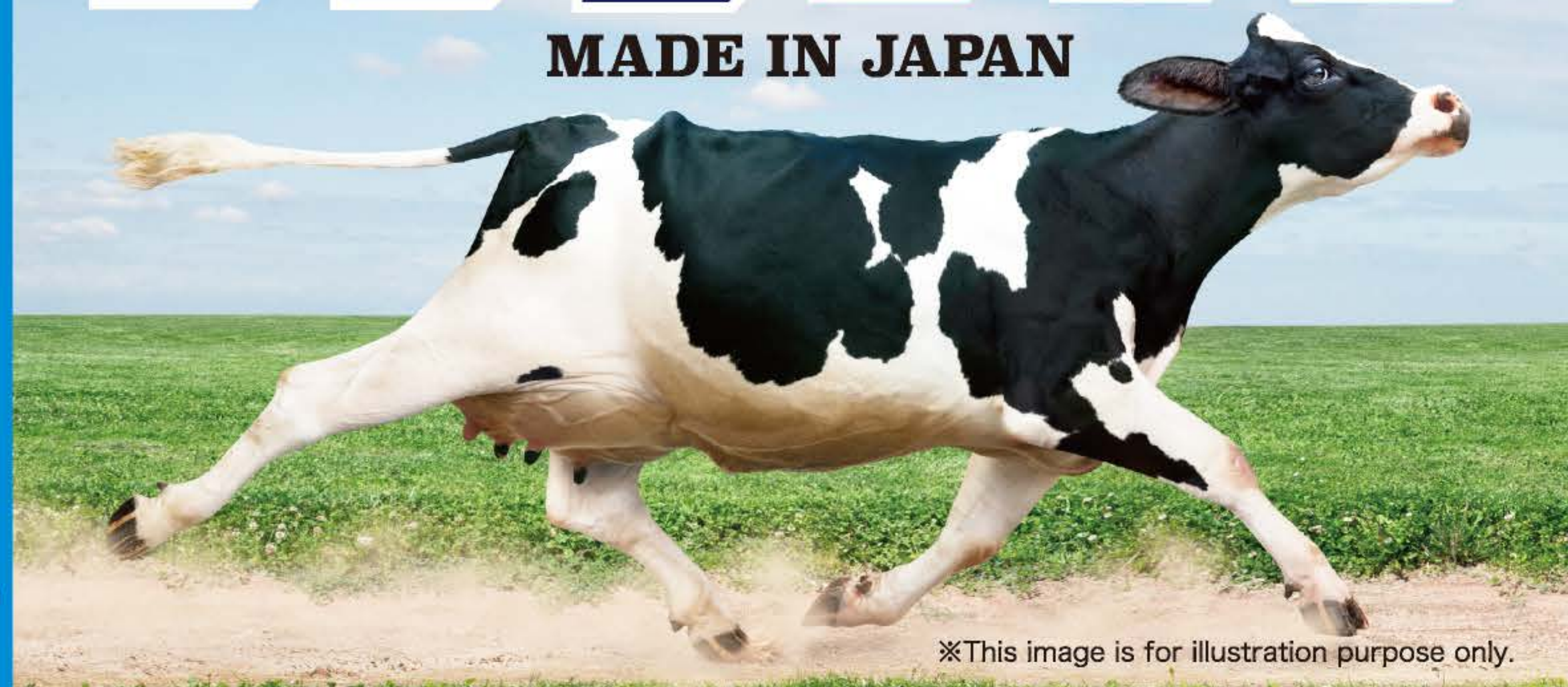
*This image is for illustration purpose only.